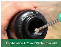
Combination 1/2" and 3/4" bottom inlet