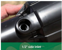
1/2" side inlet