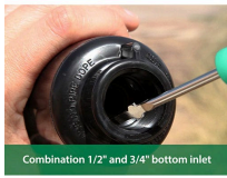
Combination 1/2" and 3/4" bottom inlet