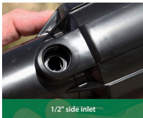
1/2" side inlet